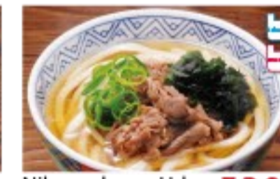
Niku-wakame Udon 肉わかめうどん 530yen Noodle soup topped with sweet beef and seaweed