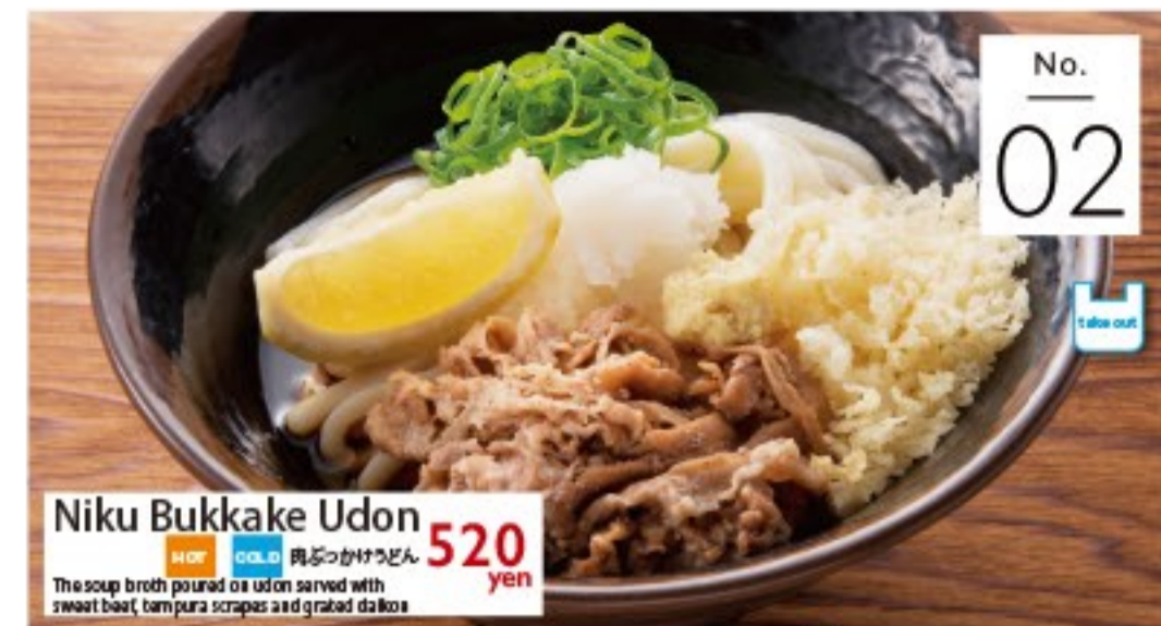
Niku Bukkake Udon 520yen The soup broth poured on udon served with sweet beef, tempura scrapes and grated daikon