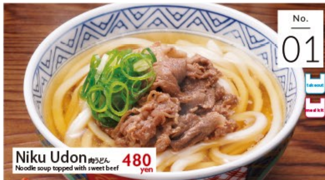
Niku Udon 肉うどん 480yen Noodle soup topped with sweet beef