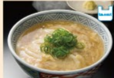
Tokitama-ankake Udon 460yen Noodle in a pot with beaten egg thickened in starchy sauce. Served with grated ginger