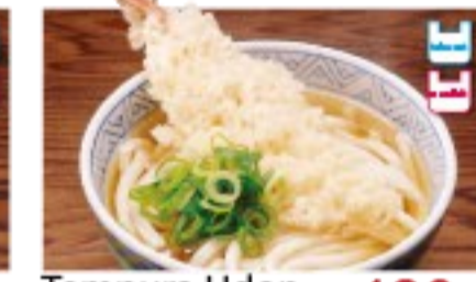
Tempura Udon 天ぷらうどん 480yen Noodle soup topped with deep fried prawn