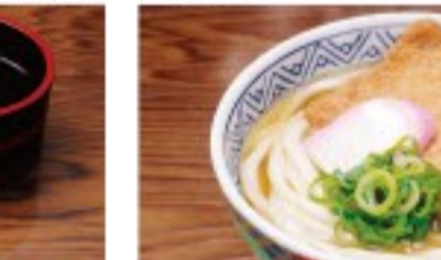
Kitsune Udon きつねうどん 450yen Noodle soup topped with deep fried bean curd