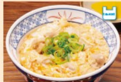
Oyako-don 親子丼 560yen Bowl of rice with chicken served over beaten egg