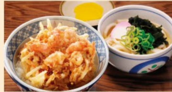
Ebi Kakiage-don set えびかき揚げ丼セット 760yen A set of bowl of rice with shrimp and mixed vegetables Tempura & Noodle soup topped with sea weed and boiled fish paste