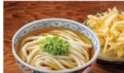
Kakiage Udon かきあげうどん 460yen Noodle soup topped with mixture of vegetables fried in batter