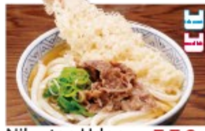
Niku-ten Udon 肉天うどん 550yen Noodle soup topped with sweet beef and deep fried prawn