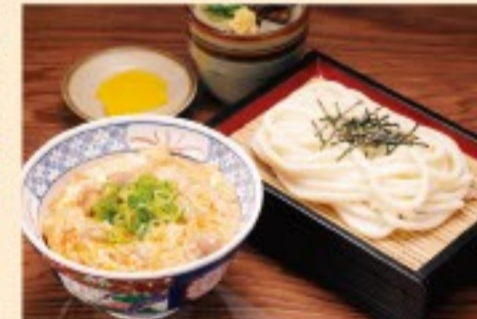
Zaru Udon & Oyako-don set 740yen A set of bowl of rice with chicken served over beaten egg & Cold noodle and sweet soy sauce for dipping