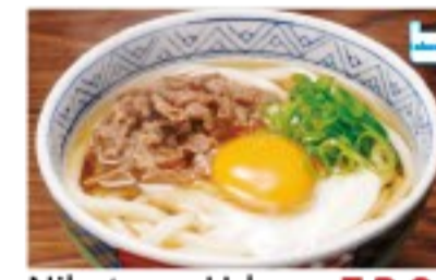
Nikutama Udon 肉玉うどん 530yen Noodle soup topped with sweet beef and a raw egg