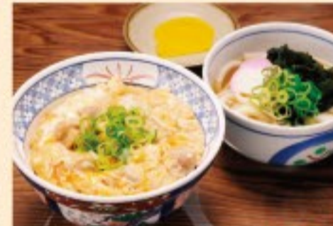
Oyako-don set 親子丼セット 740yen A set of bowl of rice with chicken served over beaten egg & Noodle soup topped with sea weed and boiled fish paste