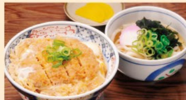
Katsu-don set かつ丼セット 760yen A set of bowl of rice with deep-fried pork cutlet served over beaten egg & Noodle soup topped with sea weed and boiled fish paste