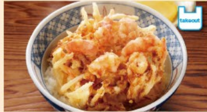
Ebi Kakiage-don えびかき揚げ丼 580yen Bowl of rice with shrimp and mixed vegetables Tempura