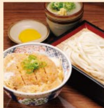
Zaru Udon & Katsu-don set 760yen A set of bowl of rice with deep-fried pork cutlet served over beaten egg & Cold noodle and sweet soy sauce for dipping