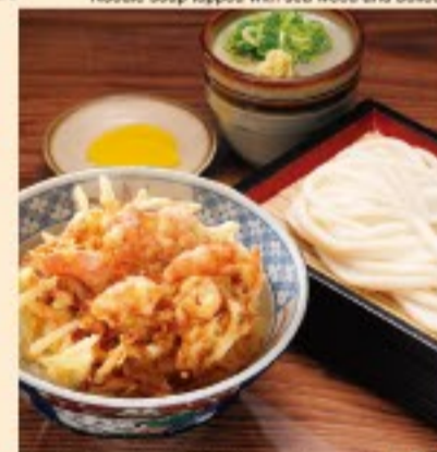
Zaru Udon & Ebi Kakiage-don set 760yen A set of bowl of rice with shrimp and mixed vegetables Tempura & Cold noodle and sweet soy sauce for dipping