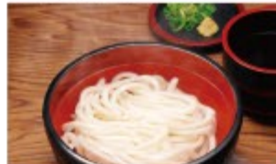
Kama-age Udon 釜揚げうどん 460yen Noodle in hot water with sweet soy sauce for dipping