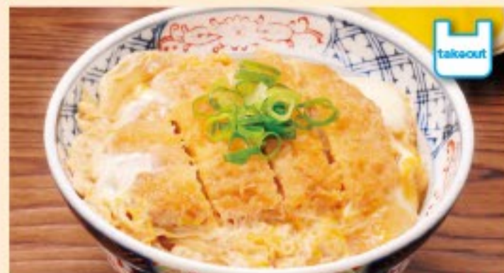
Katsu-don かつ丼 580yen Bowl of rice with deep-fried pork cutlet served over beaten egg